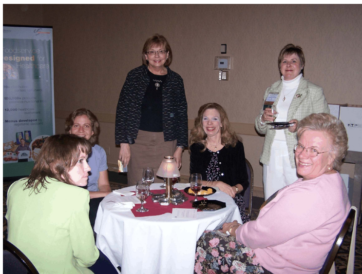
MDA members enjoying the wine-tasting.