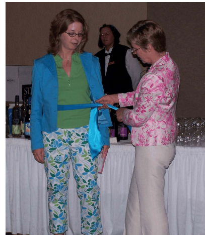
A fashion associate from Casual Corner preps MDA member for the fashion show